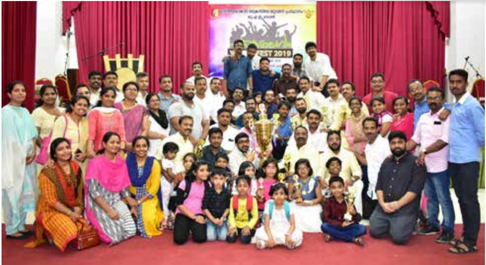
OCYM UAE Zonal Youth Fest Sargolsavam 2019 - St. Thomas OCYM Dubai Unit has won the Overall Championship. Heartfelt Congratulations to all our Participants.