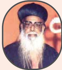
ബെബിയോസ് മാർത്തോമ്മ മാത്യൂസ് പ്രഥമൻ ബാവ 18-ാം ഓർമ്മ, നവംബർ-8 (ദേവലോകം അരമന)