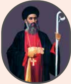
പരിശുദ്ധ ഗിവർഗീസ് മാർ ഗ്രിഗോറിയോസ് (പരുമല തിരുമേനി) 117ാം ഓർമ്മ, നവംബർ-2 (പരുമല പള്ളി)