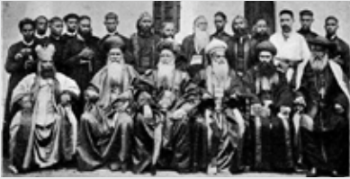
ഒരു അപ്പർവ്വ ചിത്രം.

ആറു മെത്രാപ്പോലീത്തമാരും കത്തനാർമാരും ശൈമാശൻമാരും കോട്ടയം പഴയ സെമിനാരിയിൽ.