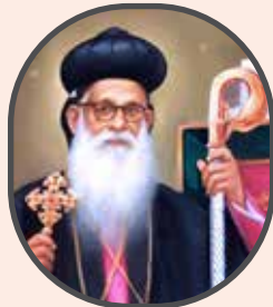
തോമാ മാർ ദിവന്നാസിയോസ് 42-ാം ഓർമ്മ, നവംബർ-3 (പത്തനംപുറം ദയറ)