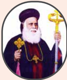
വലിയപറമ്പിൽ ഗിവർഗീസ് മാർ ഗ്രിഗോറിയോസ് 48-ാം ഓർമ്മ, നവംബർ-6 (തൃക്കുന്നത്തു് സെമിനാരി, ആലുവ)