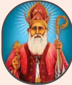
പുലിക്കോട്ടിൽ ജോസഫ് മാർ ദിവന്നാസിയോസ്-1 198-ാം ഓർമ്മ, നവംബർ-24 (പഴയ സെമിനാരി)