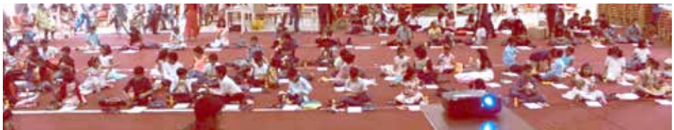
Drawing, painting and colouring competition on 'Tolerance' topic organised by MGOCSM on 25th of October as the part of MGOCSM day celebration.