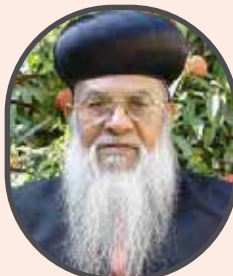
സതേഷാനോസ് മാർ തേവോദോസിയോസ് 7-ാം ഓർമ്മ, നവംബർ-5 (ദിലായ്, സെന്റ് തോമസ് ആശ്രമം)